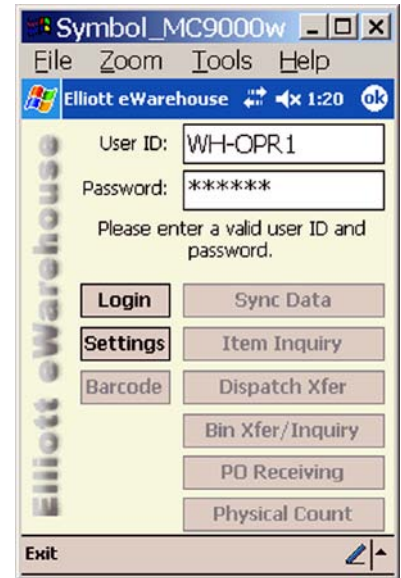
eWarehouse Login Integrates with Elliott Security