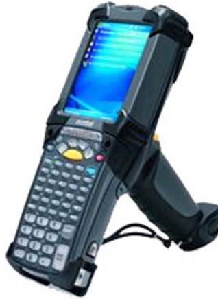
Symbol MC9000 Windows Mobile Scanner

The eWarehouse Advance Version will require your warehouse to have wireless coverage. It does not have to cover the entire warehouse which may significantly reduce your wireless hardware cost.